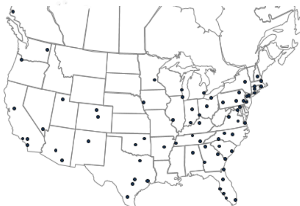
● Jan-Pro Locations